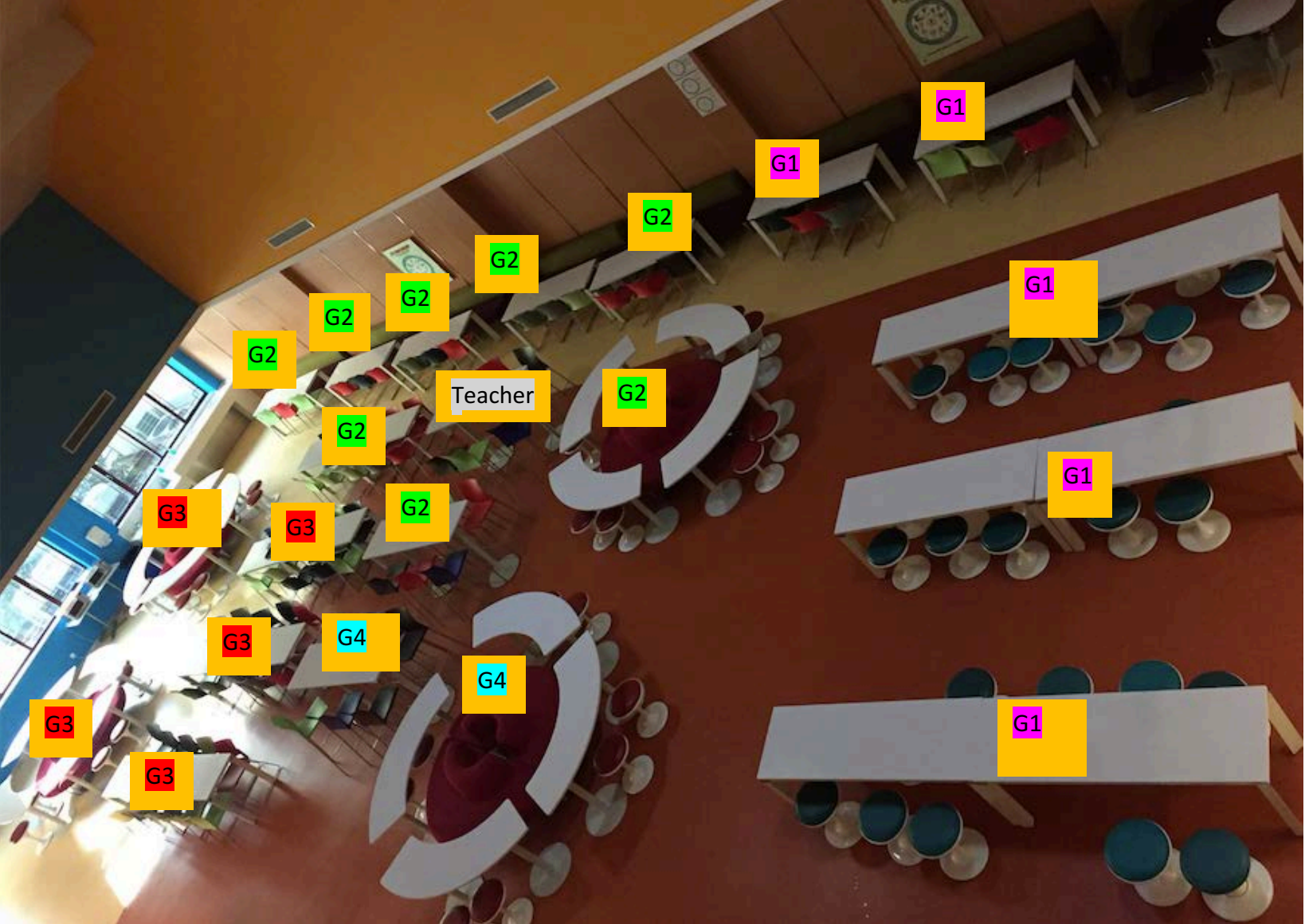
PYP Lunchtime Cafeteria Plan