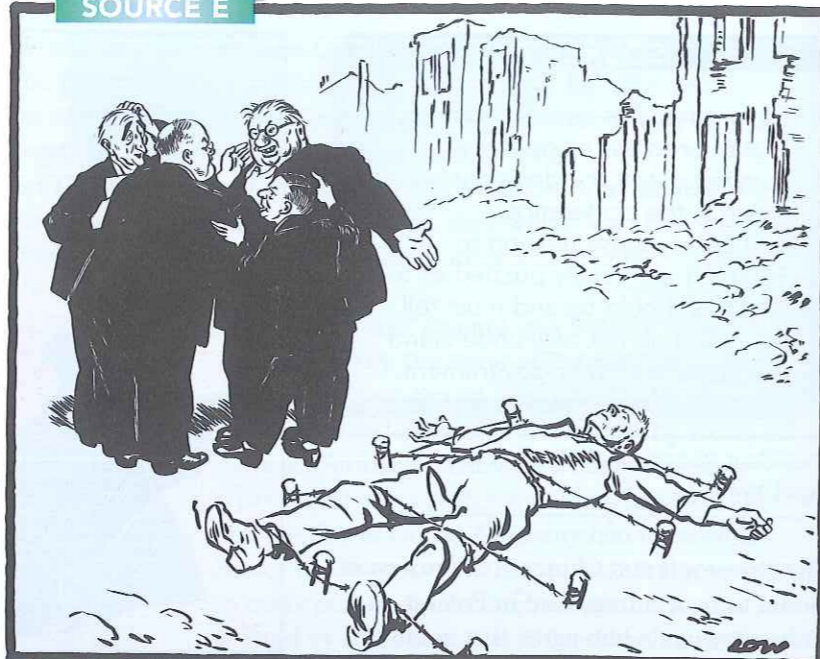
"IF WE DON'T LET HIM WORK, WHO'S GOING TO KEEP HIM?"

A cartoon from a British newspaper in July 1946. The foreign ministers of the wartime allies are arguing over what should be done to Germany now that the war is over.