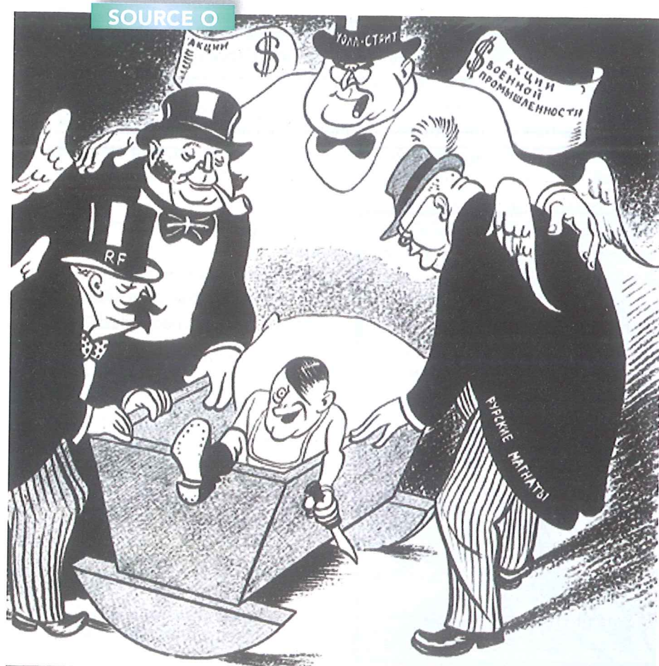
A Soviet cartoon of 1936 showing western nations as Hitler's protectors.

After the destruction of Czechoslovakia, it was clear that Poland would be Hitler's next target. Germany had obvious claims on some Polish territory. The 'Polish corridor', which split East Prussia from the rest of Germany, had been taken from Germany by the Treaty of Versailles, as had the city of Danzig, which was now a 'free city' under League of Nations control. Hitler wanted these areas back. He also wanted Polish territory as Lebensraum (living space).