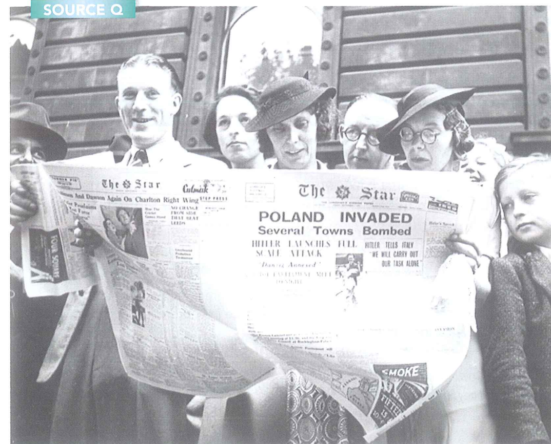
A group of British people reading about the invasion of Poland, 3 September 1939.